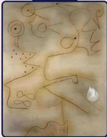
Peinture (painting 1925)