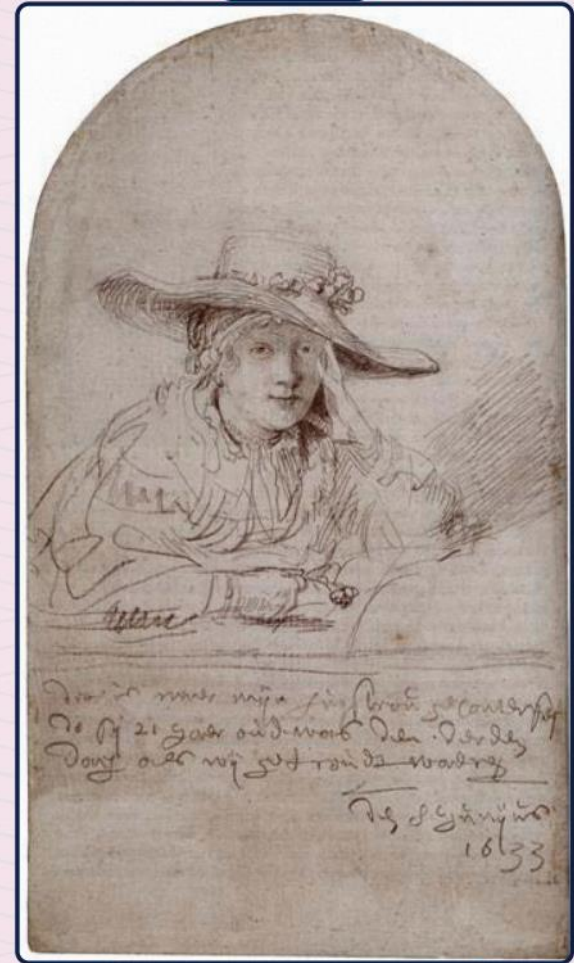
Saskia in a Straw Hat (1633)