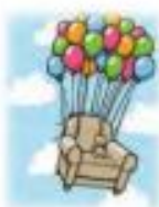
chair in the air

Phonemes we will be focusing on this week in school -